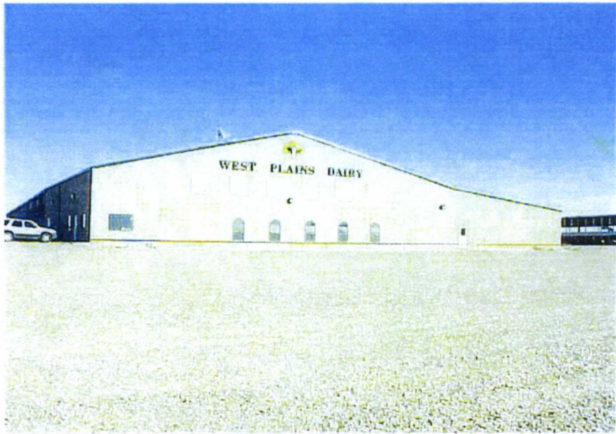
Milk Parlor/Office – Viewing Southeasterly