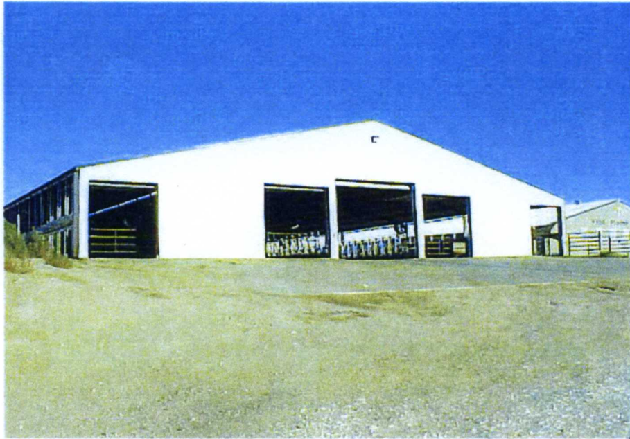
North Freestall Barn – Viewing Southeasterly